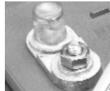
Embedded AP with Stud Terminal (EAPS)