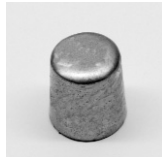
Automotive Post (AP)