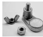
Wingnut Terminal (WNT)