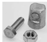
Universal Terminal (UT)